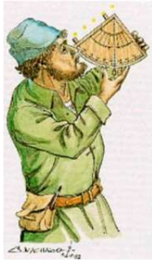
Name of the instrument Quadrante Century 15 th