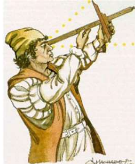
Name of the instrument Balestilha Century 16 th